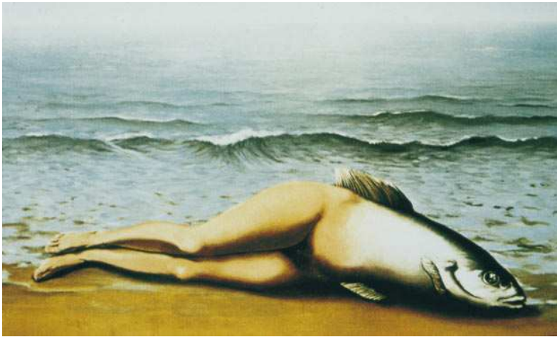
Figure 2. L'Inventive collective ( The Collective Invention ). René Magritte, 1930. © 1997 C. Herscovici, Brussels/Artists Rights Society (ARS), New York.

erties are revealed. By contrast, the complex world of disease is deliberately the focus of the clinical scientist (7). Clinical scientists lack the freedom to choose their targets. They must play the hand that nature has dealt them. The rheumatologist works on rheumatoid arthritis not because it is soluble but because patients are suffering. Non-insulin-dependent diabetes mellitus is “a geneticist’s nightmare,” yet its solution is imperative. Rarely can clinical scientists solve problems like these with the certainty that basic science provides. Clear-cut results are difficult to achieve, and this invites conflicting conclusions and controversy. Under such circumstances it is easy to see why NIH funding for clinical research is so often out of reach.